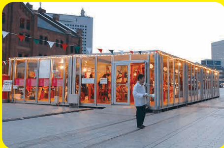
*This is an image

Riverside Garden, which offers natural relaxation and healing on the Shiraishi River bed illuminated by cherry blossom illumination, is now available for the first time. It's a special three-day event where you can enjoy menus and drinks related to cherry blossoms and flowers provided by local kitchen trucks in a tent that is integrated with the illuminations.